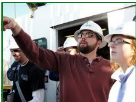
Creighton U. students learn about natural gas drilling from Chesapeake Energy.

E nvironmental excursions lead students to explore the impacts on communities made in order to harvest Appalachia's coal, natural gas, and alternative energy to feed the needs of the region, nation, and world. In meeting with activists with opposing views, participants gain an appreciation for the complexity of such issues. While not a service-focused trip, the groups do perform a valuable service centered around the environment. The unique and objective education, coupled with daily reflections, result in a "call to action" for each individual and group to implement upon returning home.