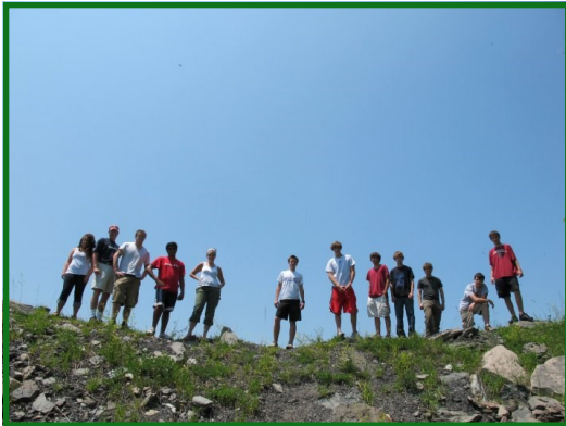
Brophy College Prep HS explores Kayford Mountain, a nature preserve surrounded by mountain top removal coal mining.

The trip costs $300/person/week with a minimum of 10 people. If the group has less than 10, the cost will still be the same as if the group had the full number. This cost includes meals, lodging, programming, and resource materials. Deposits must be made approximately 6 months in advance.