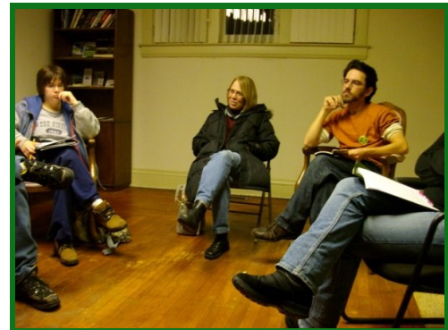
Wheeling Jesuit U. students discuss calls to action while meeting with representatives from the Student Environmental Action Coalition.